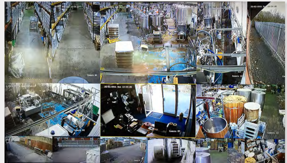
The video wall shows live feeds from all the cameras on site.