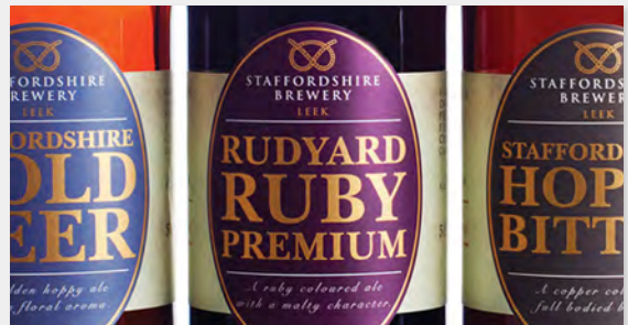
The brewery offers a range of triple-cold-filtered beers.